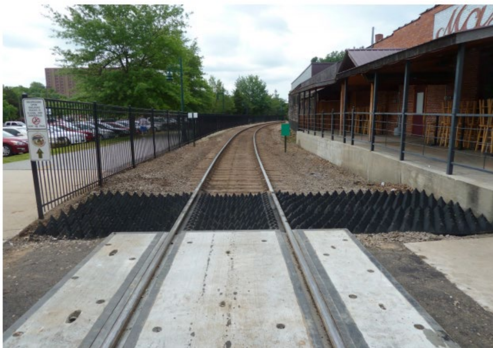
Figure 1. Anti-trespass panels installed at a grade crossing in Fayetteville, AR.