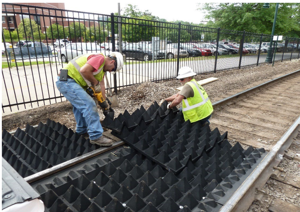
Figure 2. Anti-trespass panels installed at a grade crossing in Fayetteville, AR.