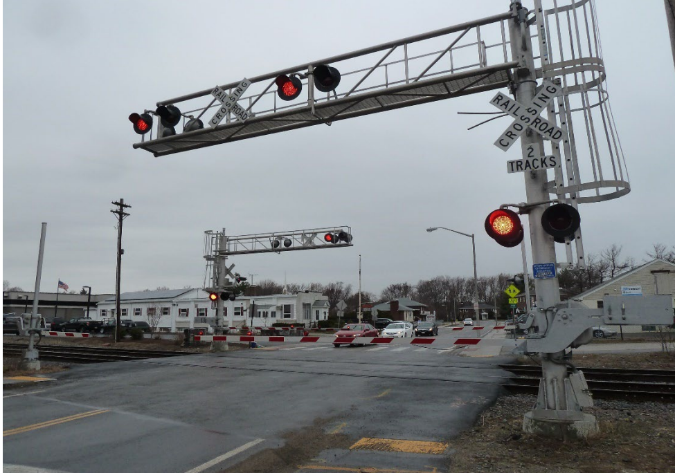
Figure 3. Example of automatic gate at a grade crossing in Belmont, MA