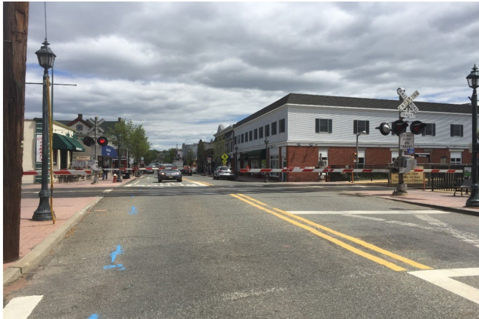
Figure 1. Example of automatic gate at a grade crossing in Ramsey, NJ