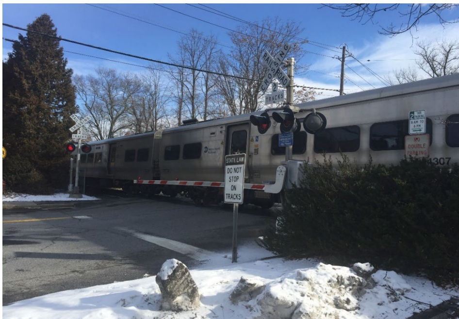
Figure 2. Example of automatic gate at a grade crossing in Katonah, NY