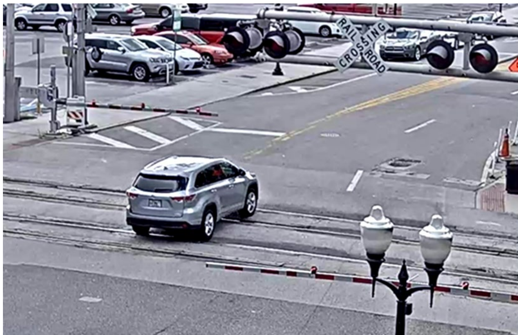
Figure 4. Example of a violation captured by CCTV in Orlando, FL.