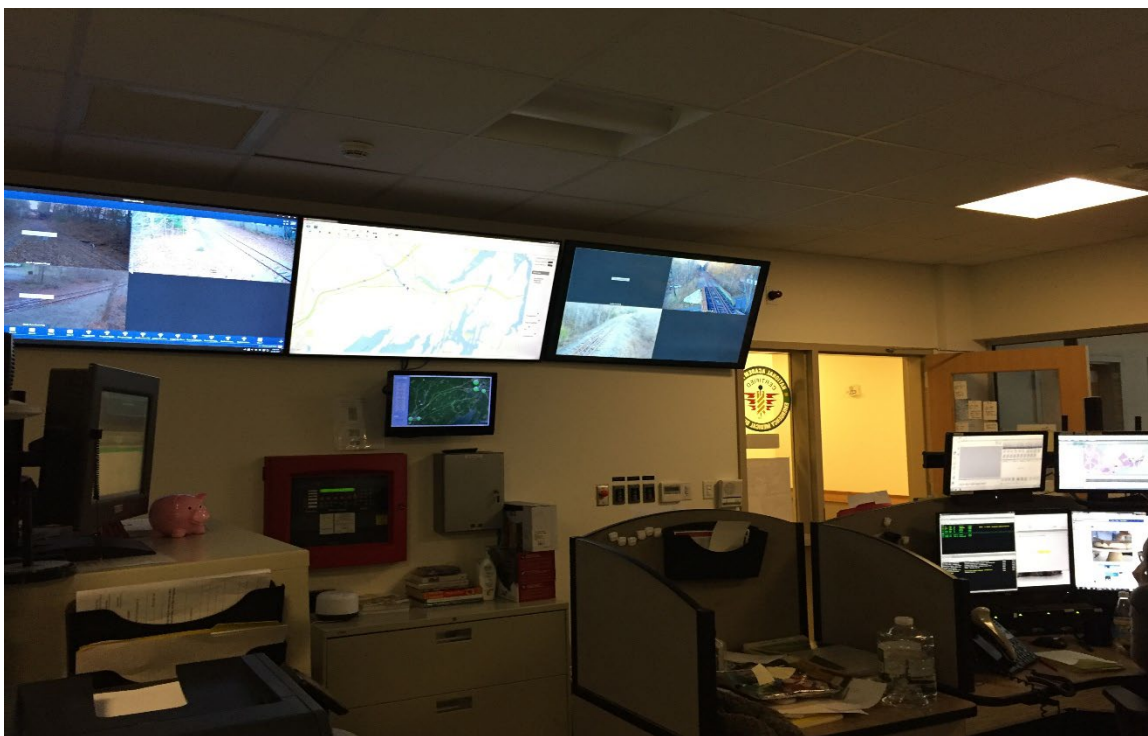
Figure 2. Example of live CCTV feed to local police dispatch in Brunswick, ME