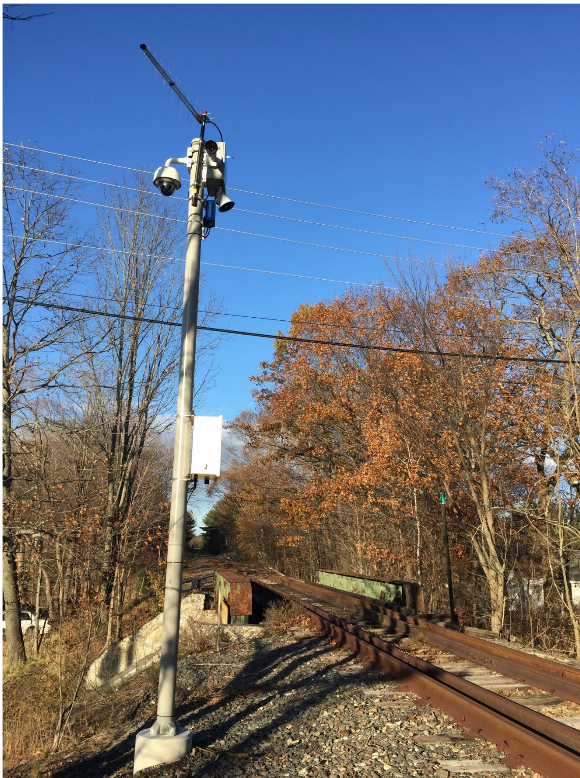
Figure 3. Example of CCTV surveillance equipment on rail right-of-way in Brunswick, ME