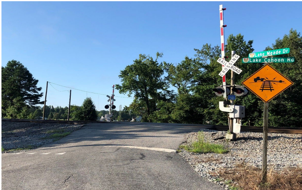
Figure 3. Example of a humped crossing in Suffolk, VA Image Credit: Volpe Center