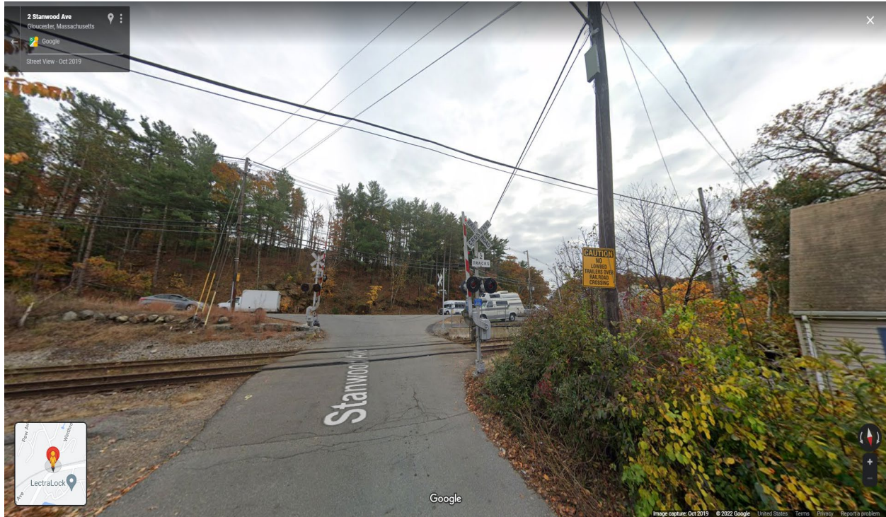
Figure 2. Example of a humped crossing in Gloucester, MA