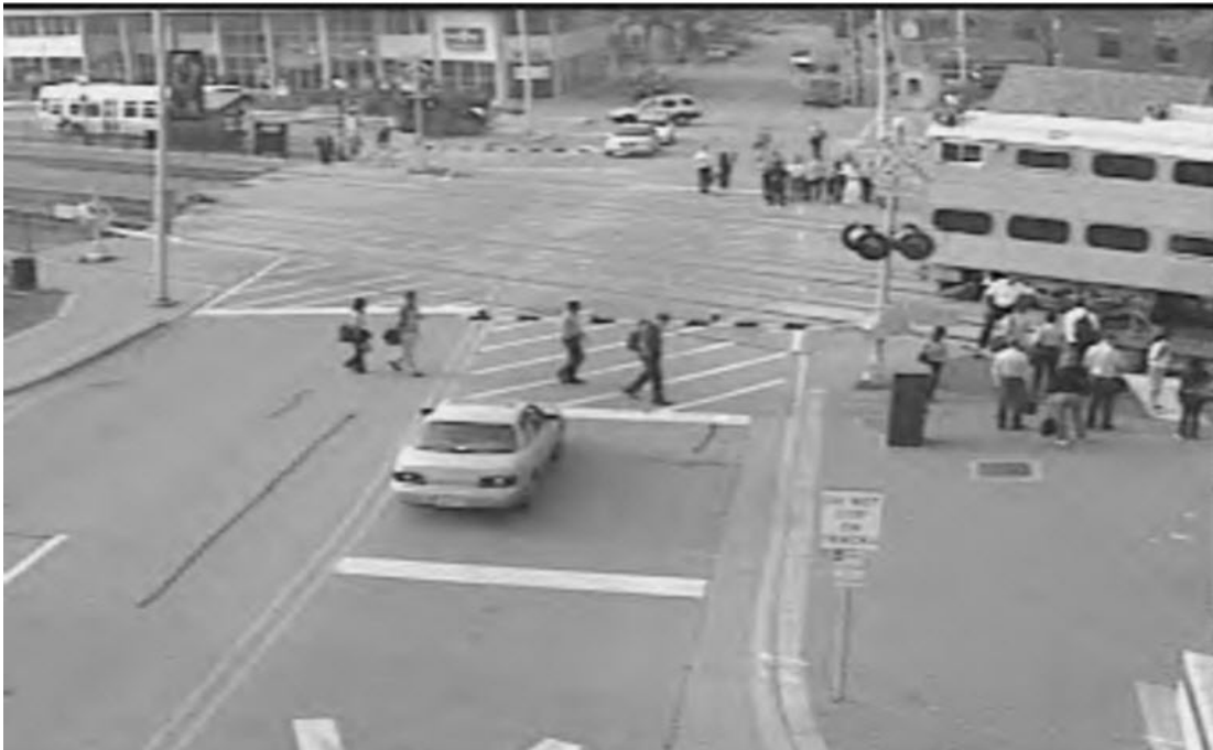
Figure 1. Law enforcement prevents commuters from accessing boarding platform during crossing activation